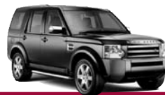
Tata Motors recently acquired Jaguar and Land Rover from Ford for $2.3 billion. Tata Motors is part of the Tata Group, one of India's biggest industrial conglomerates.

pupils, and decrepit schoolhouses are no doubt startling to those who thought—who have been repeatedly told—that India is a model of educational excellence. Indeed, a Times reader who picked up the paper just two weeks earlier would have learned that Indian education is the envy of the world (a "craze"), and that East