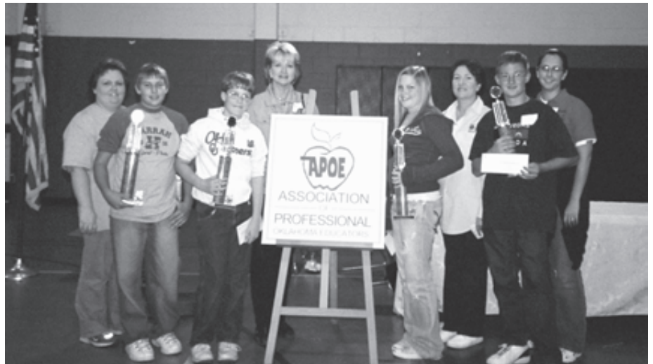
First-prize winners at the TIVY Math Tournament last fall.

Nearly 400 students in fourth through ninth grades from across Oklahoma converged on the Moore Community Center in Moore, Oklahoma, to compete in the