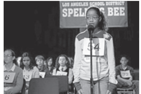
A scene from the movie Akeelah and the Bee (Lions Gate Films, 2006). A young girl from Los Angeles tries to win the national spelling bee.

In the schools in Ohio and New York, NEH simulated a national competition. From the written test, NEH picked the