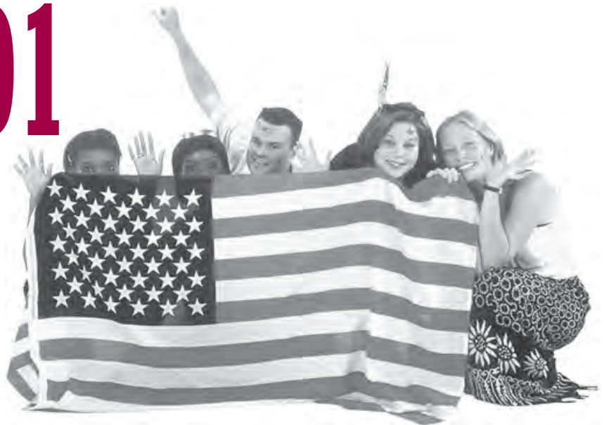
(Psst,kids...Flag Etiquette 101: don't let it touch the ground.)