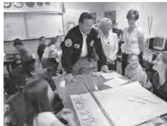
Governor Schwarzenegger talks to students during his tour of Rock Creek Elementary School in Rocklin, CA.