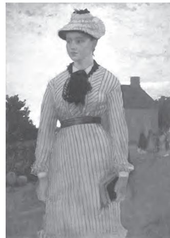
The Red School House , Winslow Homer, 1873 (National Gallery of Art, Washington, D.C.)